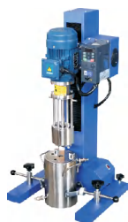
Lab Basket Mill