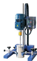
Versatile Sand-Milling Dispersing-agitator (Electric)