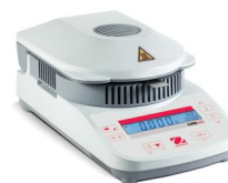
Fast Moisture Tester