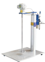
Air Pneumatic Mixer