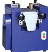
Three Rollers Grinder