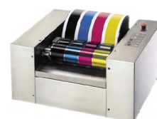
Multi-section Ink Printing Proofer