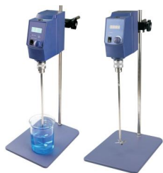
Precise Digital Overhead Stirrer