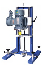
High Speed Dispersing Machine (Explosion-proof)