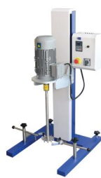
High Speed Dispersing Machine