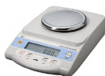
Economic Electrical Balance