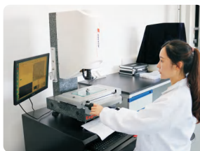
Calibration Laboratory with CNAS Certification