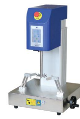
Multifunction High Speed Dispersing Machine