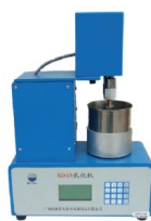
Digital Emulsification Tester