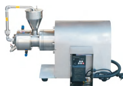
Lab Horizontal Mill