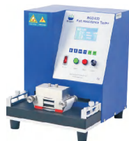
Rub Resistance Tester