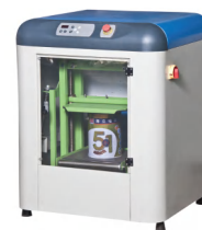
Closed Paint Mixer/Shaker