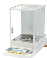
Precise Analytical Balance