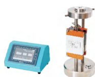
Falling Rod Viscometer