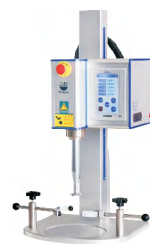
Super High Speed Dispersing Machine