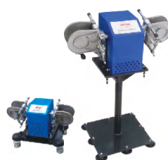
Coating Fast Mixer