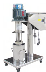
Lab Basket Mill