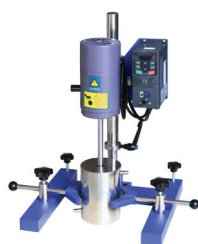
Versatile Sand-Milling Dispersing-agitator