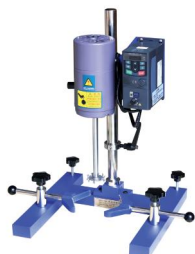
High Speed Dispersing Machine