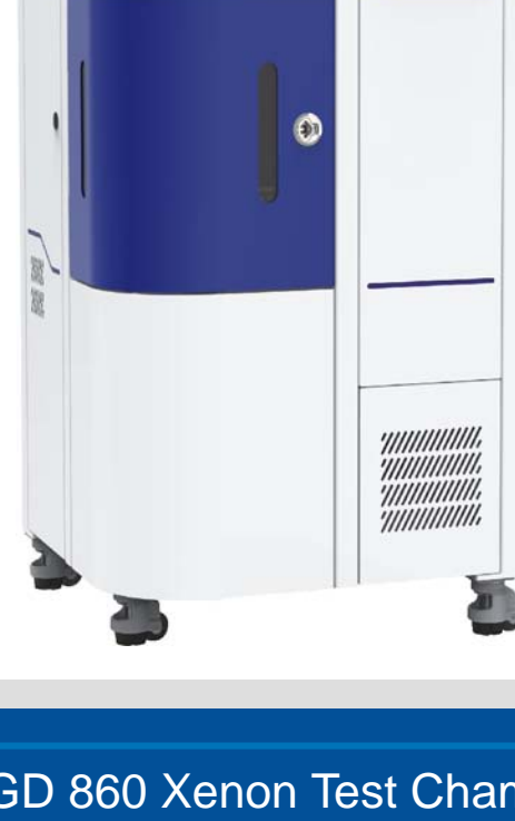
BGD 860 Xenon Test Chamber