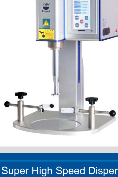
BGD 746 Super High Speed Dispersing Machine