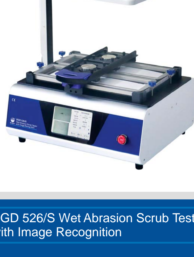
BGD 526/S Wet Abrasion Scrub Tester with Image Recognition