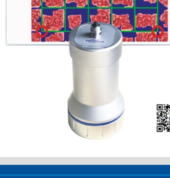
BGD 350 Image Recognizer for Cross-cut