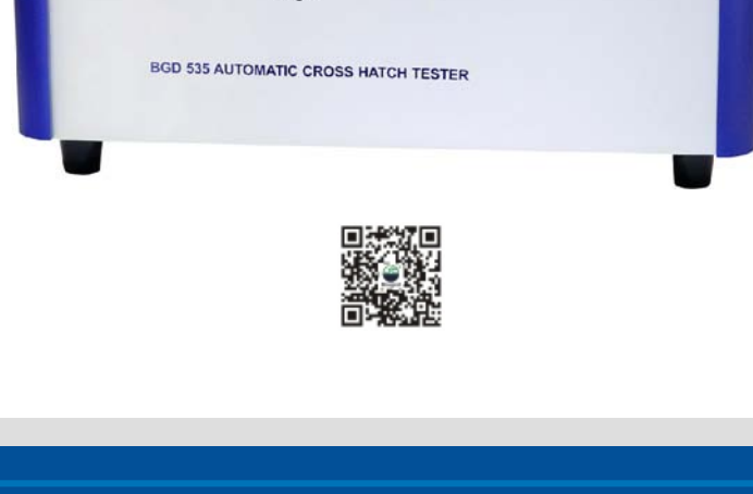
BGD 535 Automatic Cross Hatch Tester