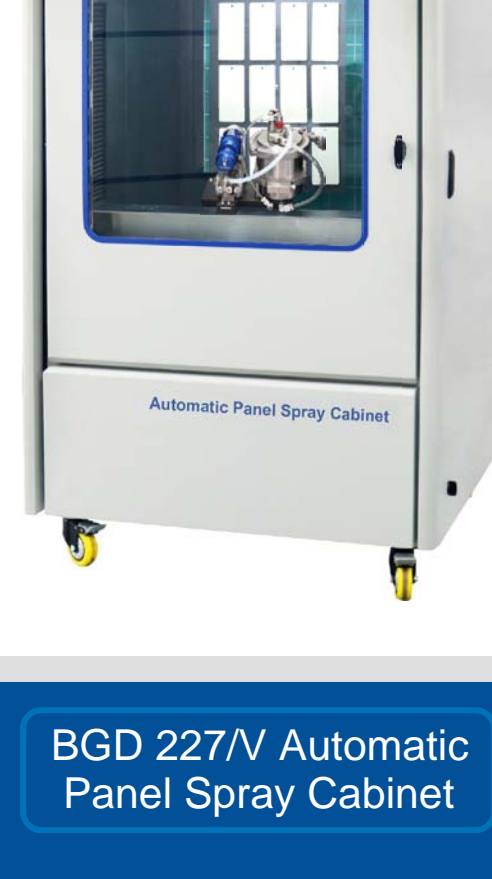
BGD 227/V Automatic Panel Spray Cabinet